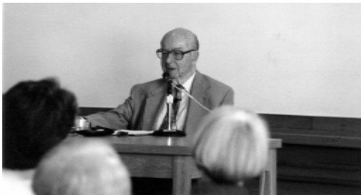
Professor Kerr at his 2000 Learning in Retirement lecture, "The 60s at the University of California as I Saw Them."